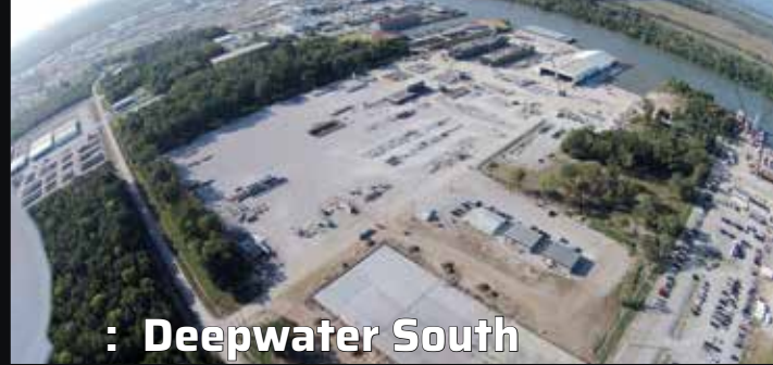
: Deepwater South

Floating Equipment: Pontoons: (13) 40' x 20' (1) 20' x 8' (3) 20' x 6' Work Barges: (3) 135' x 35' (2) 120' x 30' Yard Tug: (1) 26' x 8' Ramps: (2) 62'x13'