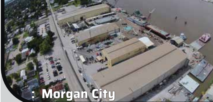
: Morgan City